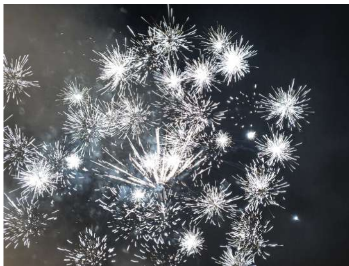
Marsworth Fireworks—Jeremy Whitehead

All proceeds go to supporting our lovely village school.