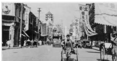
Shanghai in the 1930s