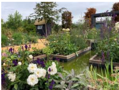
The Apothecary Garden

Our six-acre award-winning site, once a neglected allotment, is now a thriving sanctuary with sensory and apothecary gardens, wildflower meadows, vegetable plots, ponds, orchards, woodland areas, and quiet places for reflection.