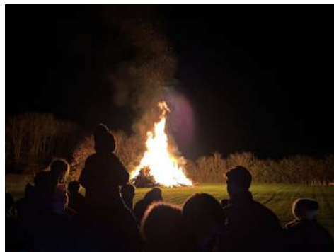
Bonfire lit—Jeremy Whitehead

The amazing bonfire added to the atmospheric village fireworks event, which was very well supported.