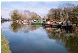
Canal at Cooks Wharf

There has been another drowning on the Grand Union Canal near Cooks Wharf, where Marsworth Parish borders with Pitstone and Cheddington. This latest loss follows the tragic drowning accident of a Cheddington man in February, and a worrying number of others over recent years.