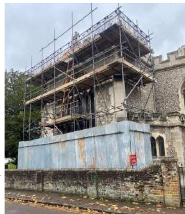
Repair works at St Peter & St Paul

St Peter and St Paul's is having essential work done to the east end of the church. Over recent years there have been cracks over the east window and in the last year or so there has been more movement and more cracks.