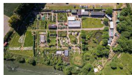
Lindengate from the air

Conservation and sustainability are also central to our work: we partner with Buckinghamshire Council to grow rare Black Poplar trees, follow no-dig methods for organic vegetables and heritage fruit trees, produce our own honey, juice, jam and compost, and capture rainwater to help sustain our ponds and wildlife. We also provide organic vegetable boxes for the local community ensuring people have access to healthy fresh food.