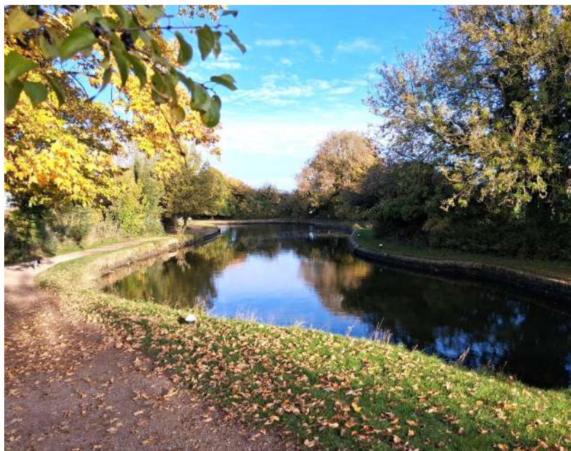
Marsworth Flight, locks 42-41—Andrew Gray