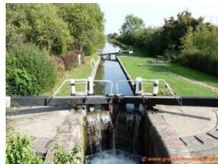
Red House lock, Aylesbury Arm

We are working closely with partners to manage every aspect of the situation and taking all steps to conserve water. During this period affected locks will be secured against operation. The gates will be 'ashed up' (a traditional method of sealing gates) to reduce leakage and reduce water loss through the lock structures.