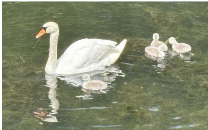
Swan and cygnets on Grand Union Canal Jeremy Whitehead