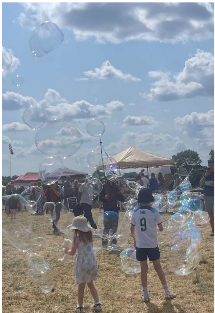
Bubbles at the Steam Rally: Liz Rollinson