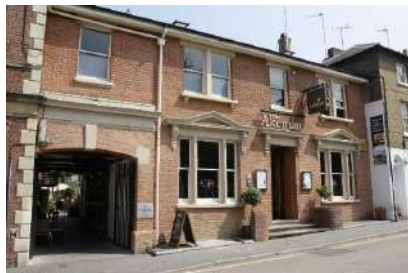
The Akeman, Tring

The Grand Junction Arms remains part of the Oakman Group.