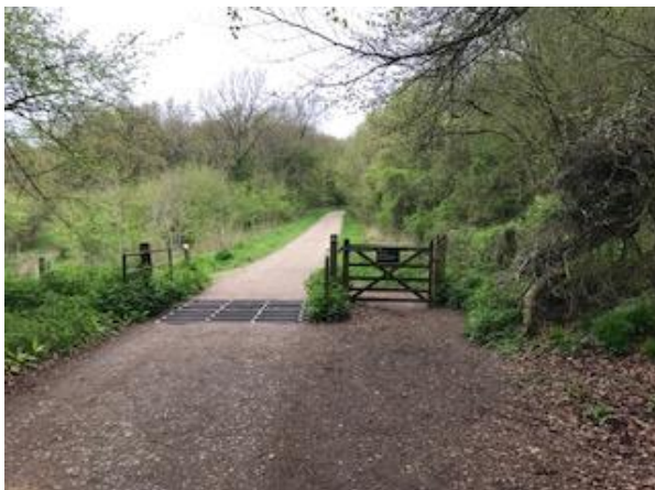
1.9 miles Cattle Grid