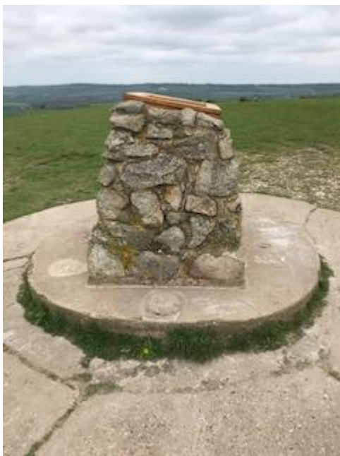
Sightseeing Chart on Ivinghoe Beacon