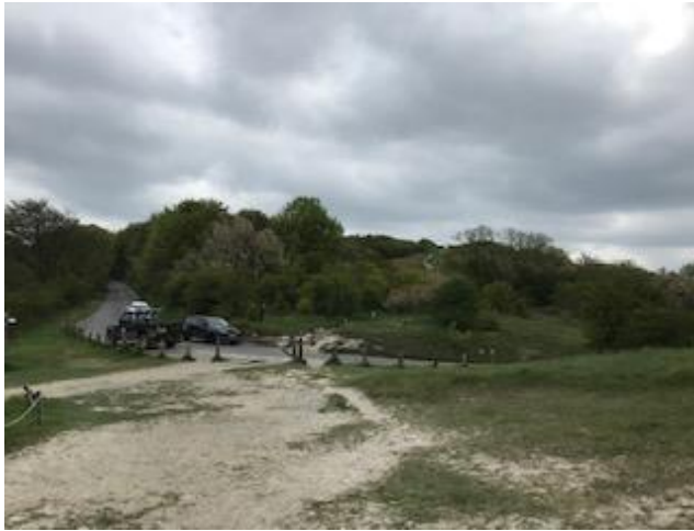
Road crossing at Point E