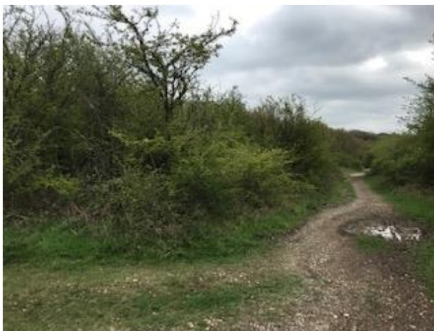
Junction of Paths at Point F. Straight on for Alternative route. Turn left onto bridleway for main route