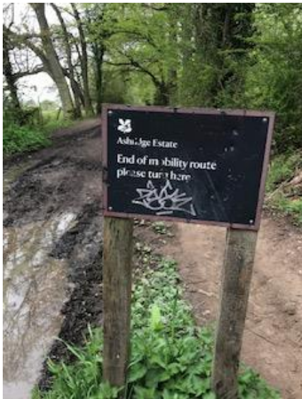
1.3 Miles – end of Mobility Track