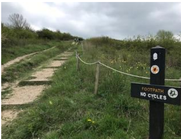
Steps past Point E on The Ridgeway